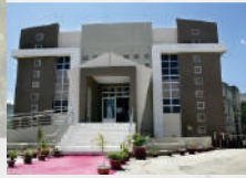
Abbottabad - Est: 1987