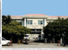
Mirpur - Est: 1977