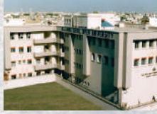
Karachi - Est: 1976