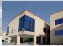
Dera Ghazi Khan - Est: 1987