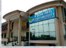
Faisalabad - Est: 1978