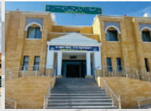
Moro - Est: 1988