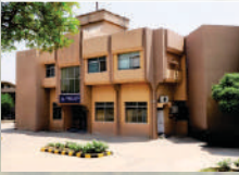
Rawalpindi - Est: 1984