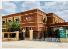
Mithi - Est: 1988