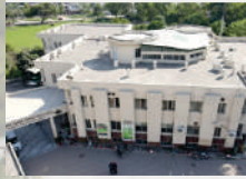
Gujranwala - Est: 1986