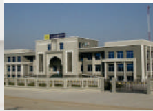
Rahim Yar Khan - Est: 2007