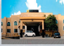
Lahore - Est: 1977