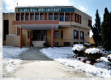
Quetta - Est: 1976