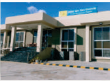
Gawadar - Est: 2000