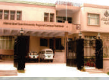
Peshawar - Est: 1977