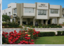
Islamabad - Est: 1984