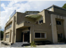
Muzaffarabad - Est: 1986