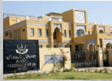
Sukkur - Est: 1984