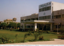
Multan - Est: 1976