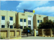
Mianwali - Est: 1987