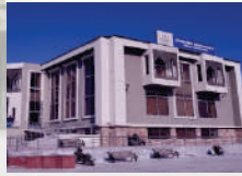
Skardu - Est: 1988