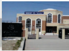
Jhang - Est: 2007