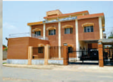
Dera Ismail Khan - Est: 1984