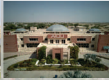
Bahawalpur - Est: 1985